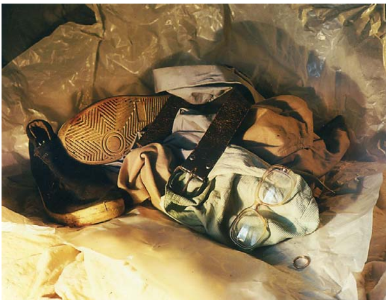
Javad's cloths delivered from morgue